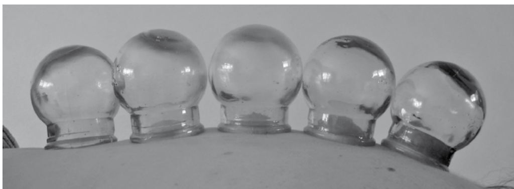
Left: The five levels of vacuum. The soft level of vacuum to the left side of the photo produces a bu /tonifying effect while the stronger cups to the right have a xie /dispersing and reducing effect. Knowing how to adapt cupping to suit each patient is a mark of a first-class cupper.

from strong to soft according to Australian animals ranging from fierce to placid: